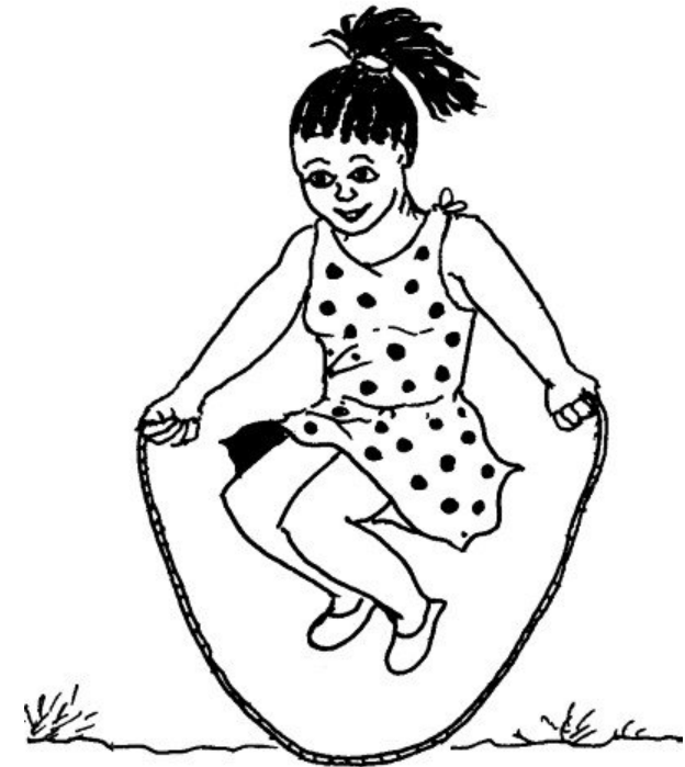
Atwero lenge kede.