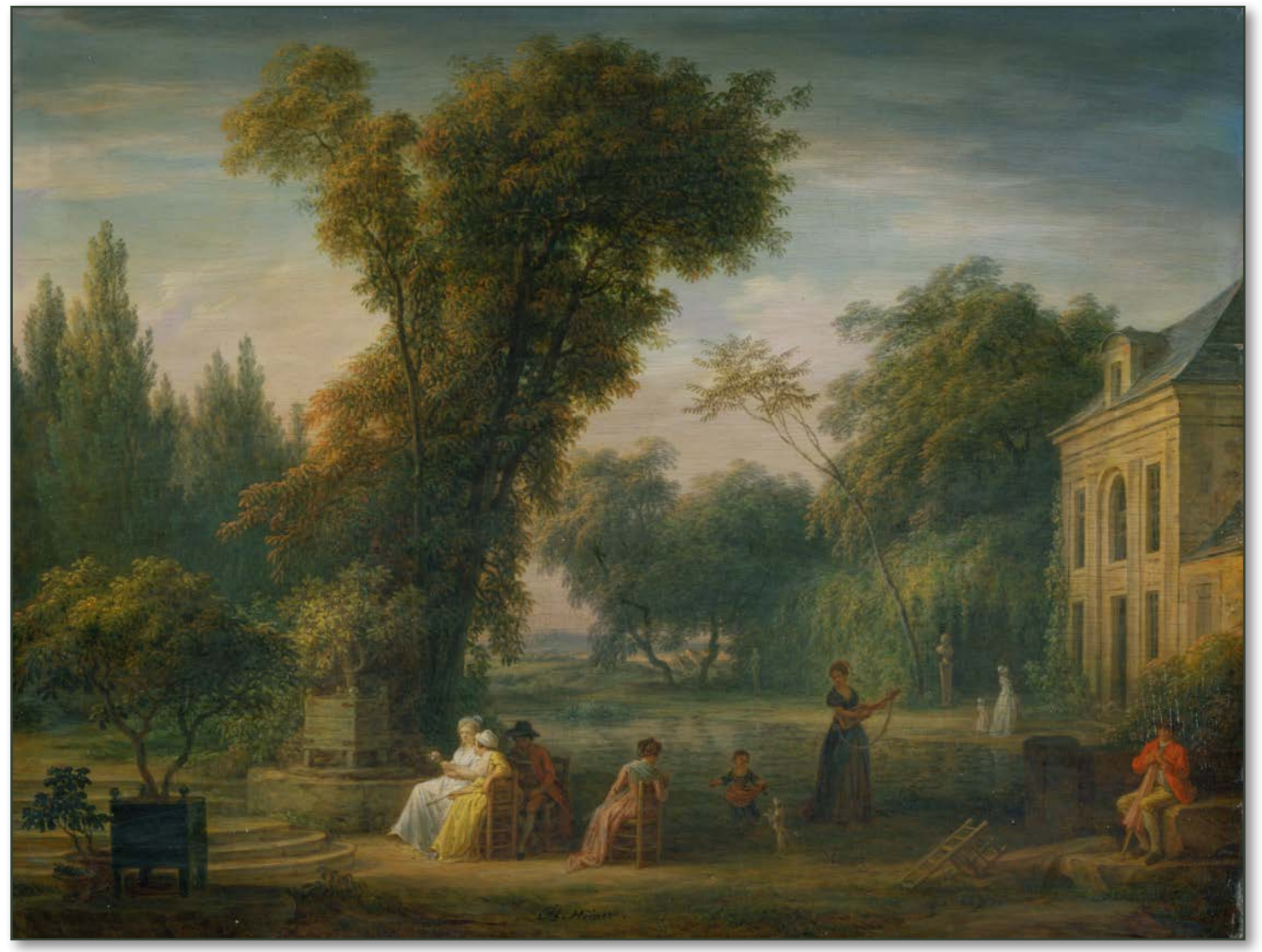
Hilair, Jean-Baptiste. Dans le Jardin. 1795. The Huntington Library. 78.20.9B