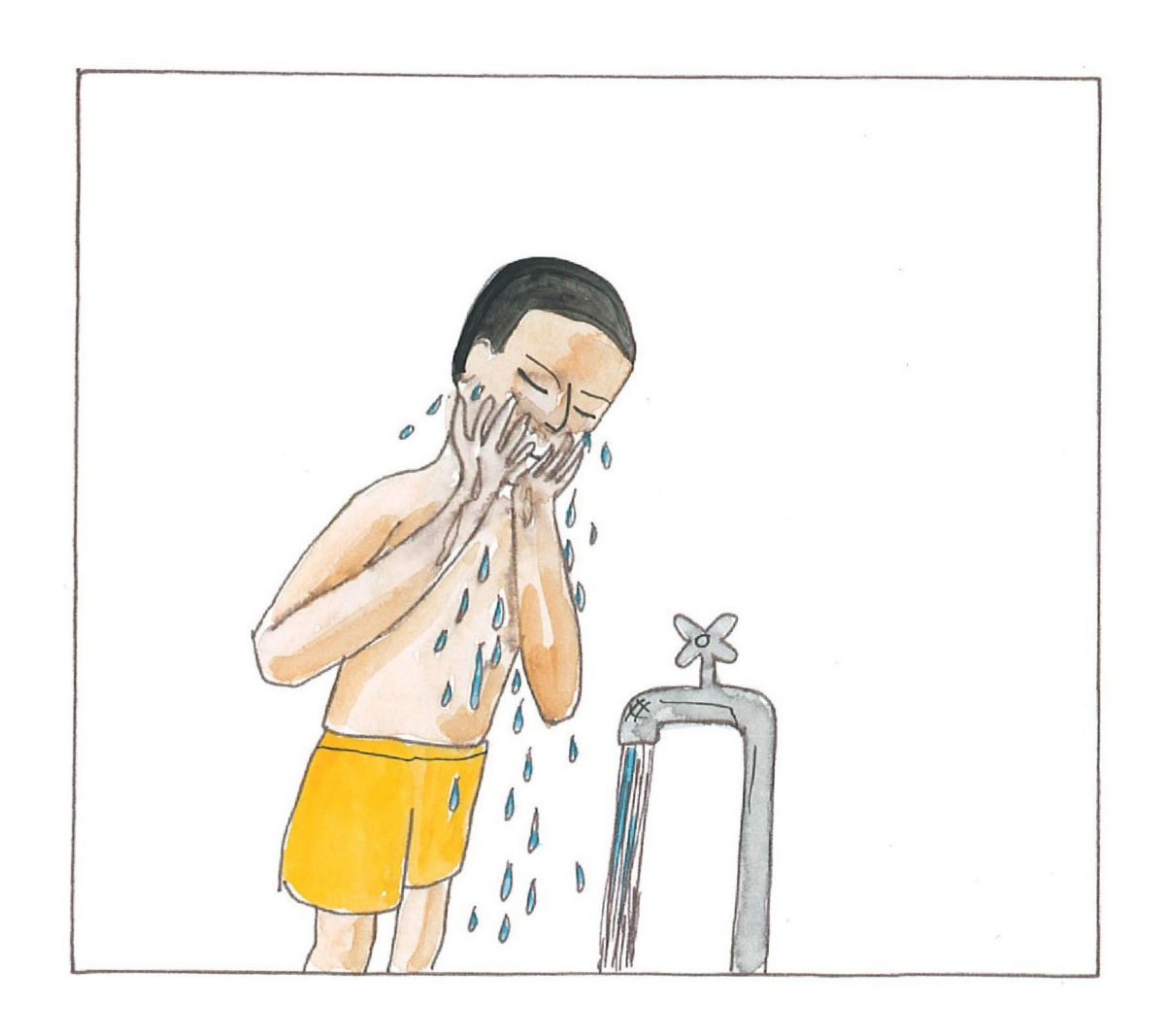
Emûjûlayô nî ômôn hoŋ. Ihuana.