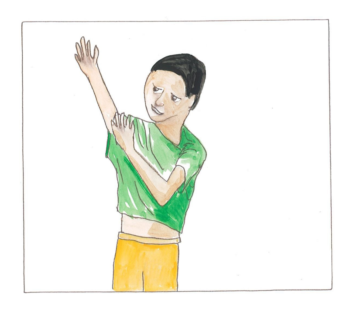
Etiyyefio nî ahûan hoŋ. Ihuana.