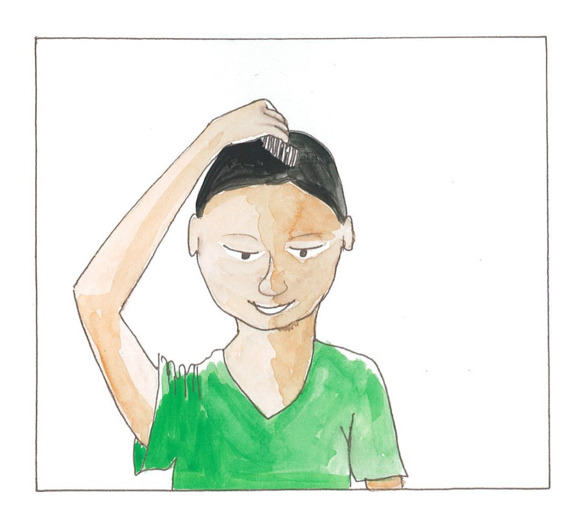
Egugurucio nî oofir hon. Ihuana.