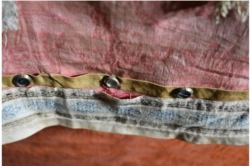
Images: Conservator Lisa Yeats photographing Loong 龍, and an example of the detailed photographs taken for condition reporting