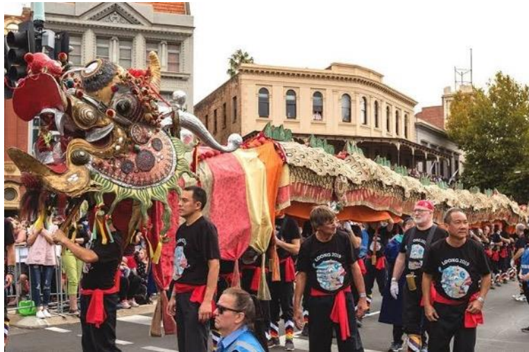
Image: Loong during parade in 2019